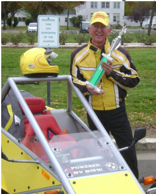
Best Modified Motorcycle