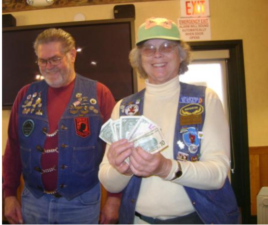
The Big Bucks!