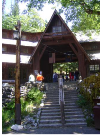
Oregon Caves Ride