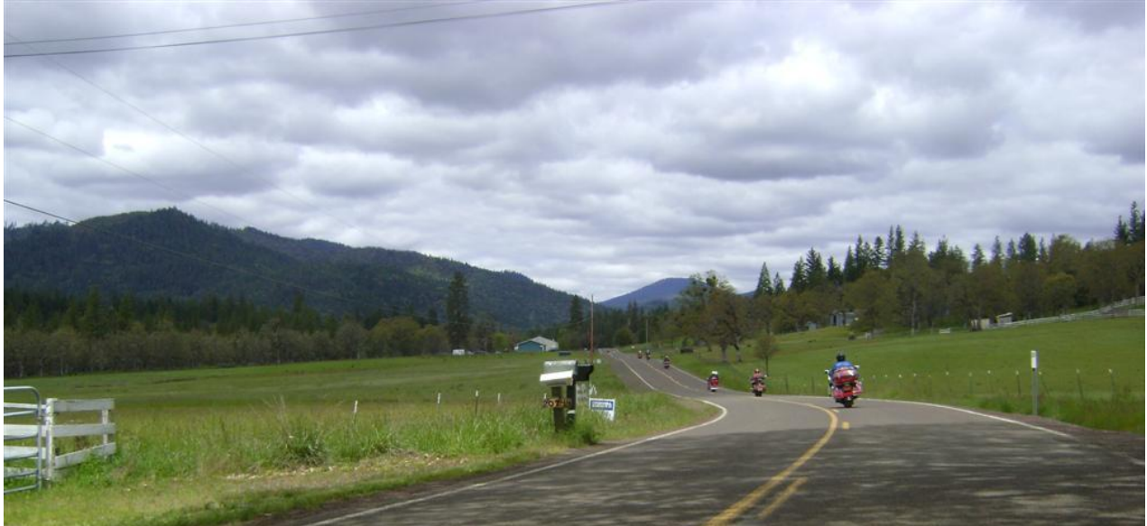
Jack Woods Ride