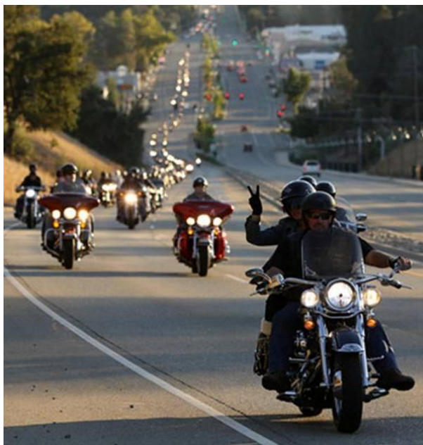
Big Bike Weekend in Redding